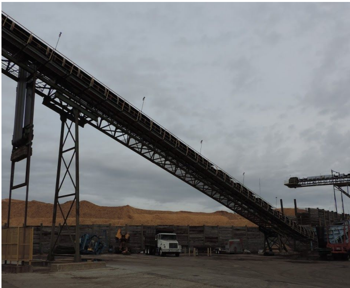
Hundreds of thousands of tons of wood pellets are shipped each year from Wilmington, NC to meet EU demand.

An analysis by Key-Log Economics examined the number of acres affected by this increased logging pressure from current and future growth of the biomass industry. Looking at the conversion rates for different types of forests, management regimes, and biomass pellet inputs, we calculated the annual rate of forest harvest and total acres of managed forest required to meet future demand.