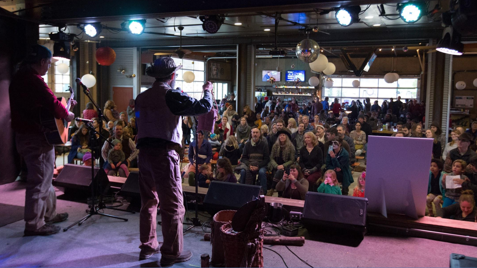
Popular naturalist and regional storyteller, Doug Elliot performs to a packed house of all ages for our first Woods & Wilds event in Asheville, NC in 2016.

"...the personal storytelling movement has grown from small gatherings in living rooms and cafes to sold-out shows in large theatres." - BBC News Magazine