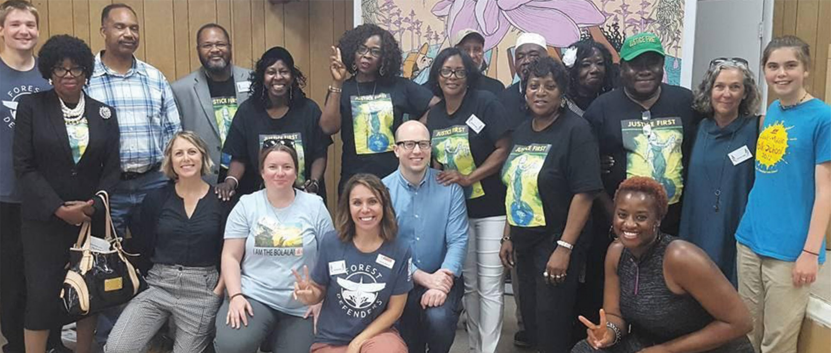
2018 Justice First Tour Stop in South Carolina

(Cont'd) The Justice First Tour helped elevate Southern forest protection as both a regional and a national climate justice priority. At the same time we at Dogwood expanded our commitment as an organization to put justice first. From 2018 to 2019 we not only grew our Community Grant program, which provides direct financial support to community groups working on the frontlines of the wood pellet industry and industrial logging, we also helped some of these partners secure direct support from our funding connections. We shifted staff capacity to provide more support to our community and justice partners, and we started aligning our strategies and tactics to better reflect the needs and wisdom of those who bear the brunt of the impacts of industrial logging and associated pollution across the South.