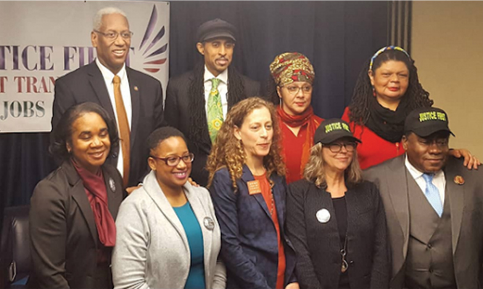
Justice First Tour on Capitol Hill, 2019

(Cont'd) Meanwhile, in the late summer of 2019, Dogwood Alliance joined the Gulf Center for Law and Policy, Southeastern Climate & Energy Network and the Justice First Network to draft a Southern version of a Green New Deal. Funded by the US Climate Action Network (USCAN), Dogwood and other coalition members are working together with frontline groups across the region to draft the first-ever unified, grassroots, frontline community-led climate policy agenda in the Southern United States. The Southern Communities for a Green New Deal is a watershed opportunity for the policy writing process to be developed by and for the communities affected most profoundly by climate change and climate polluters -- a far cry from the norm of creating policy solutions in a back room on Capitol Hill.