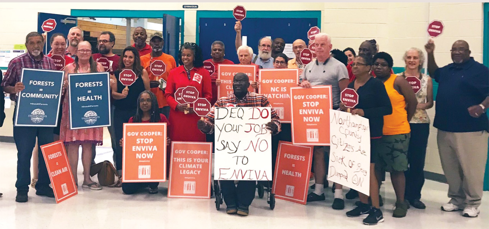
Community members and allies speaking out against Enviva at a public hearing in Northampton in 2019

As we worked internationally to change biomass policies on the demand side in Europe, we worked with partners and communities on the frontlines to stop the expansion of the wood pellet export industry across the US South. Early in 2017, Enviva, the largest exporter of wood pellets from the Southern US announced plans to expand its facilities in Richmond County, North Carolina. Despite thousands of people and 100's of scientists opposing the expansion, year later, a North Carolina judge threw out a key legal appeal against the air-quality permit.